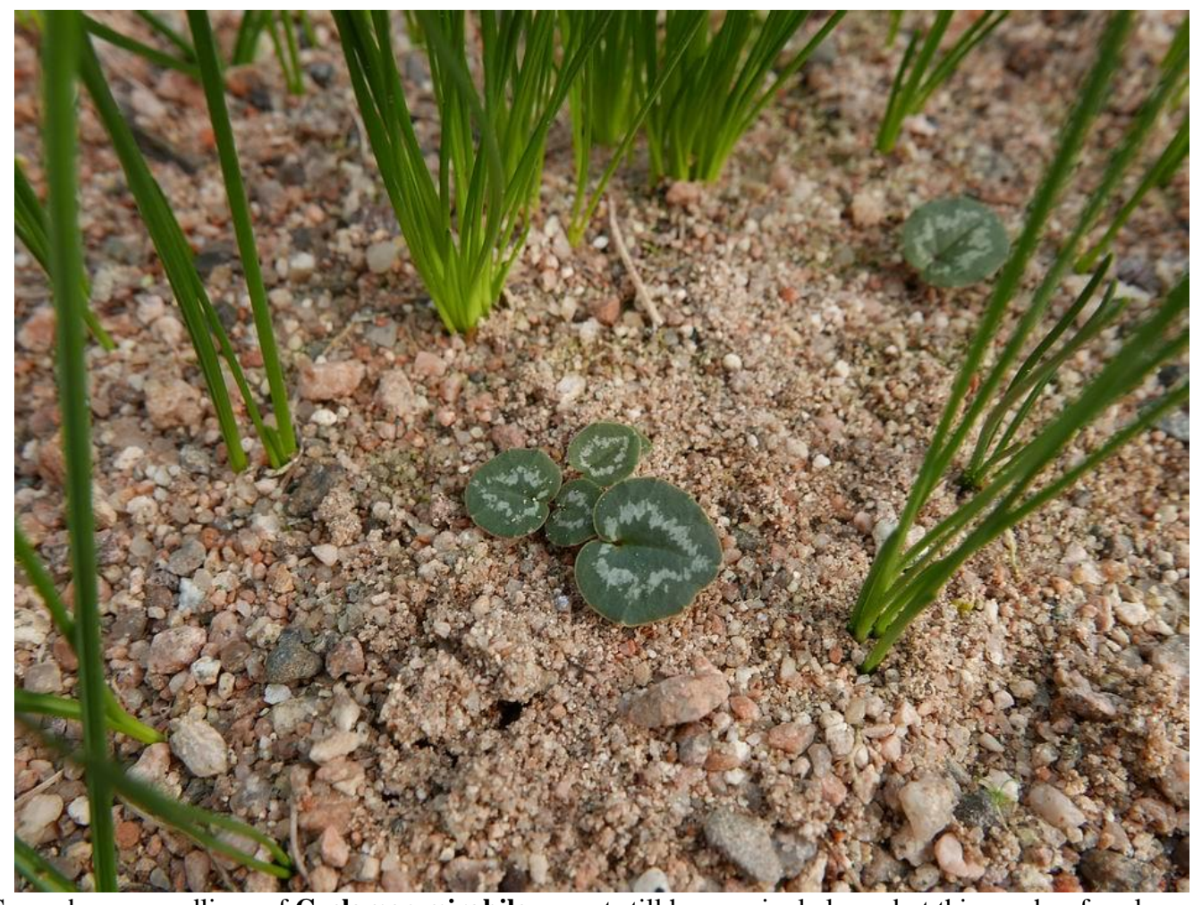
Second years seedlings of Cyclamen mirabile – most still have a single leave but this one has four leaves.