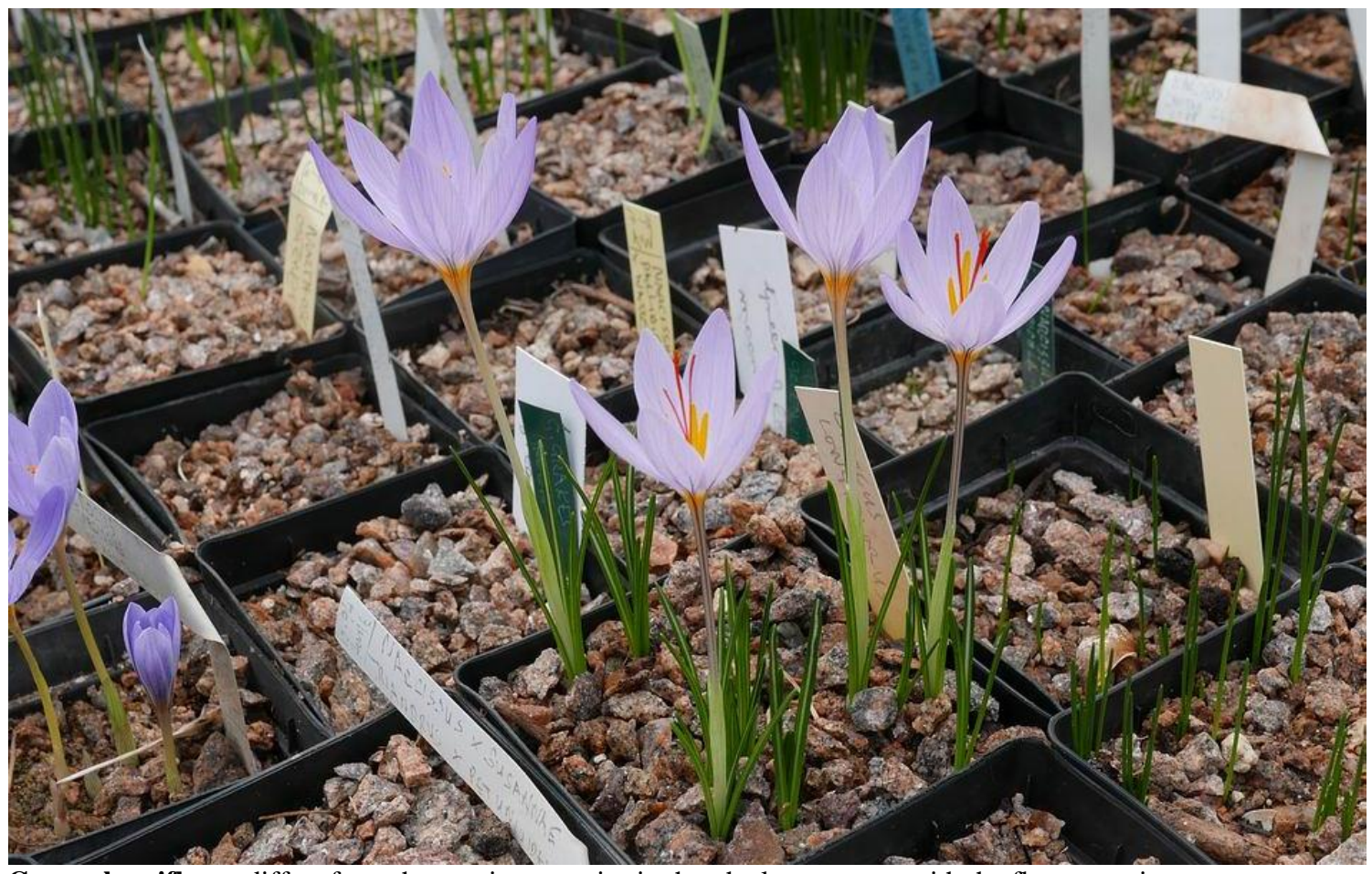
Crocus longiflorus differs from the previous species in that the leaves grow with the flowers so it gets more watering at this early stage to enable and support this growth.