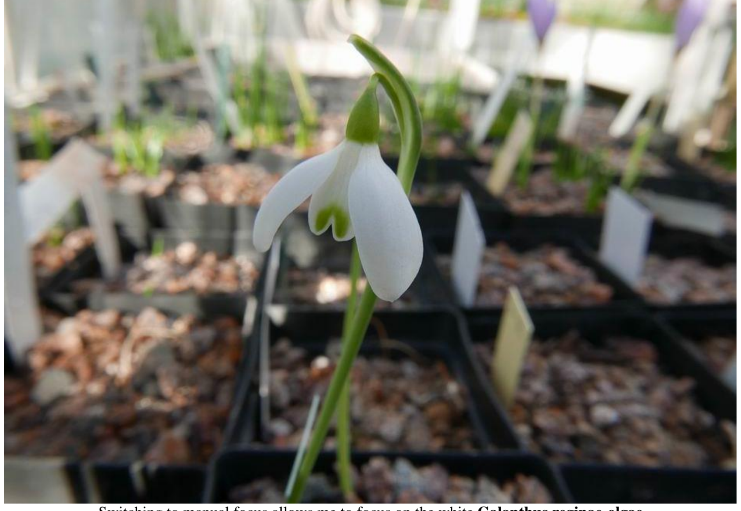
Switching to manual focus allows me to focus on the white Galanthus reginae-olgae.

Auto-focus systems on cameras can be very useful however they have their limitations. They work by searching for area(s) of contrast and then sharpening the margins however they do not always see your chosen subject even though it is right in front of them, especially when it is white with low contrast. Above: everything in the image is in reasonably sharp focus except my subject.