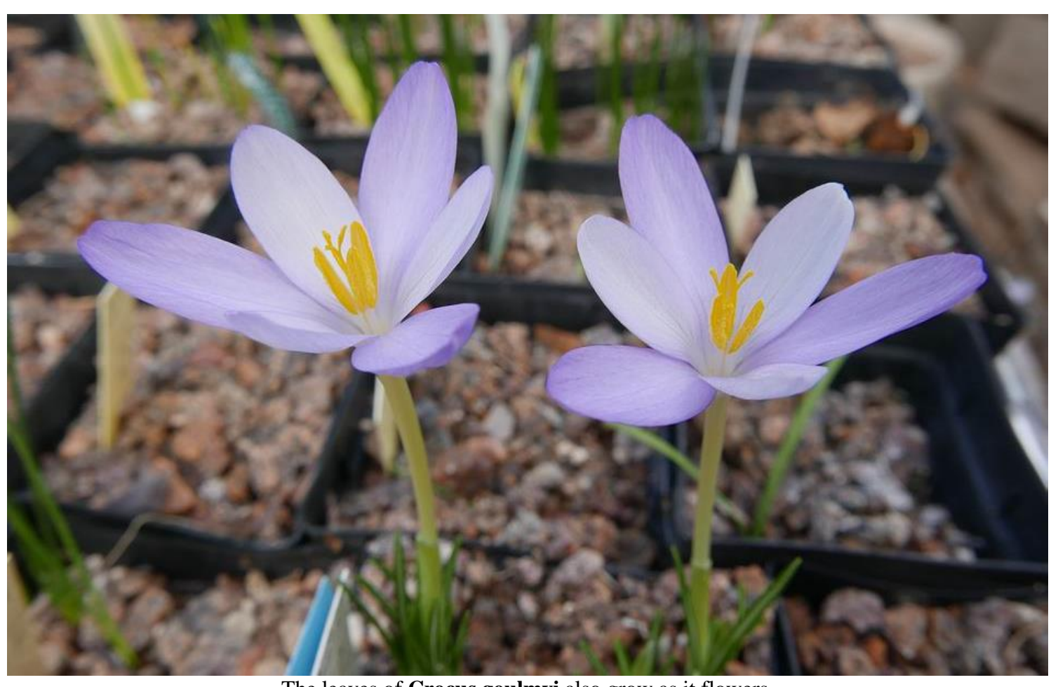
The leaves of Crocus goulmyi also grow as it flowers.