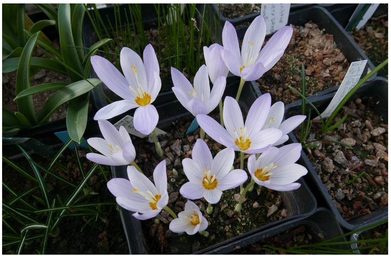
Crocus kotschyanus seeds well with each seedling having a variation of the colour theme some like this one are quite pale while others can be darker in colour – all will retain the golden yellow 'V' pattern in the centre.