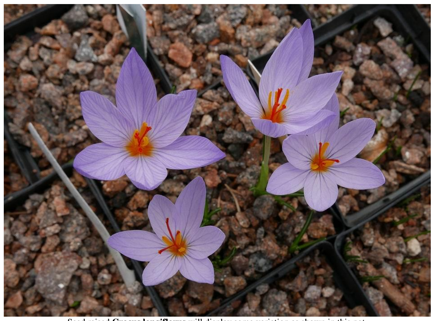
Seed raised Crocus longiflorus will display some variation as shown in this pot.