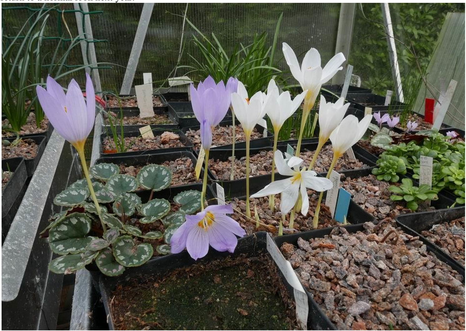
I often find self-sown seedlings in the pots that have not been replanted every year - as you can see where a Crocus kotschyanus has seeded into the pot of Cyclamen mirabile.

Flowers will often produce extra parts like this but it is rarely a fixed feature - the flowers will more than likely return to a normal look next year.