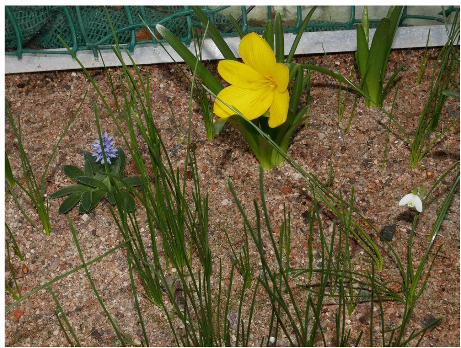
There is however plenty of growth and flowers appearing in the sand bed I started the other year.