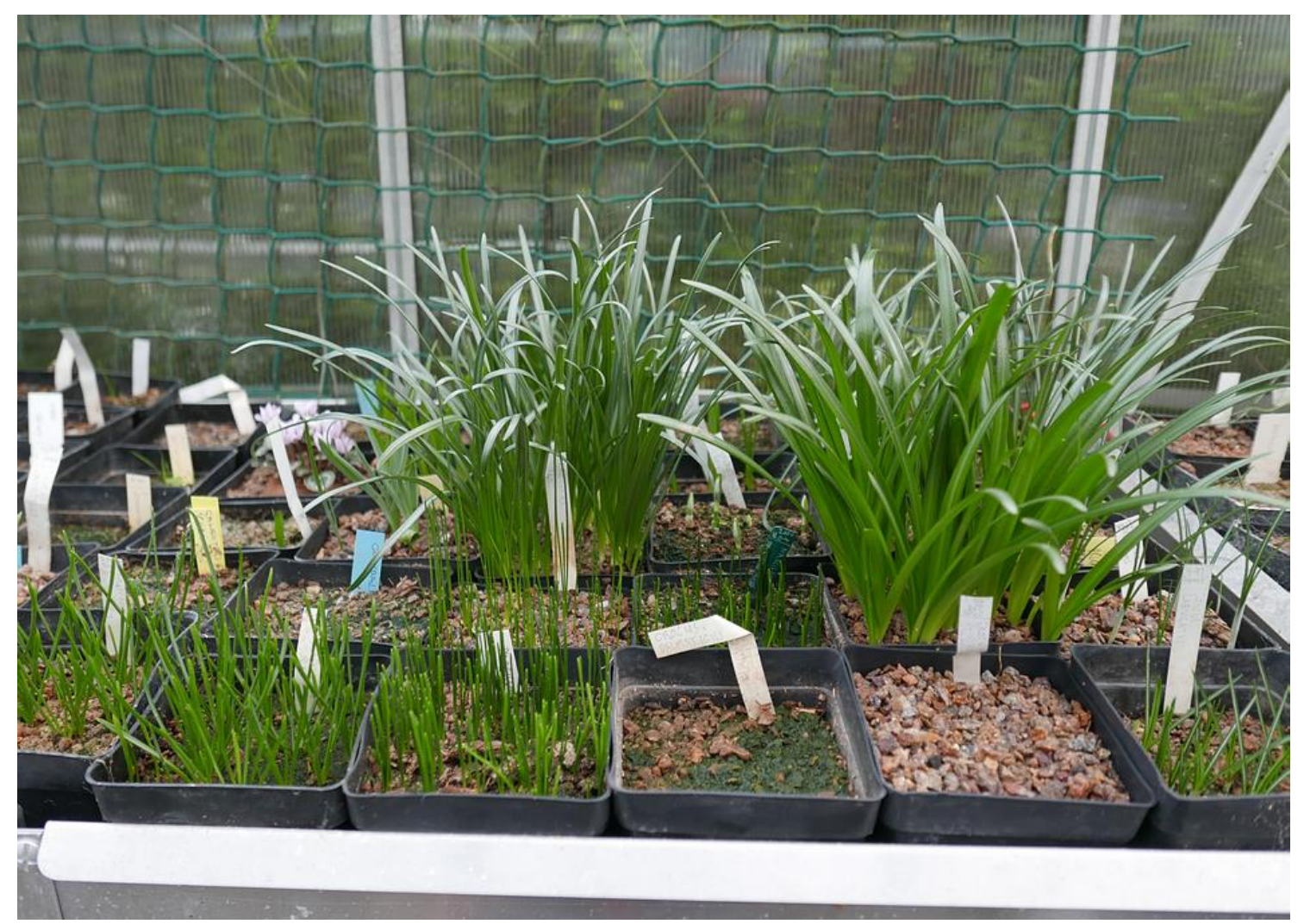
Sternbergia leaves are growing strongly and will need plenty of water especially on sunny days - also it is time I added some more feeding in the form of liquid tomato fertiliser at half the recommended strength.

Another method I often use, which is useful if your camera does not have a manual focus option, is to place my finger next to the flower I want to focus on then push the button half way down so the camera focuses, while holding the button remove the finger then push the button all the way down to capture the image. On this occasion I left my finger in to show how small this snowdrop is.