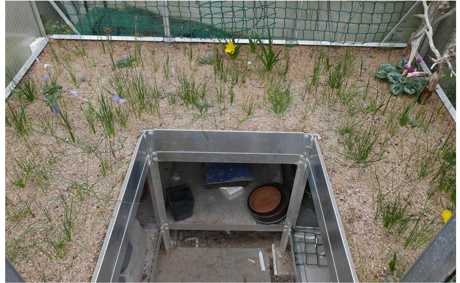
Leaf growth of many plants in the sand bed is quite advanced and I have to ensure that it is also sufficiently well-watered. One of the many advantages of growing this way can be seen in this picture where you can see that the surface of the sand is dry so the tops of the plants can be warm and dry while there is plenty of moisture available for their roots.