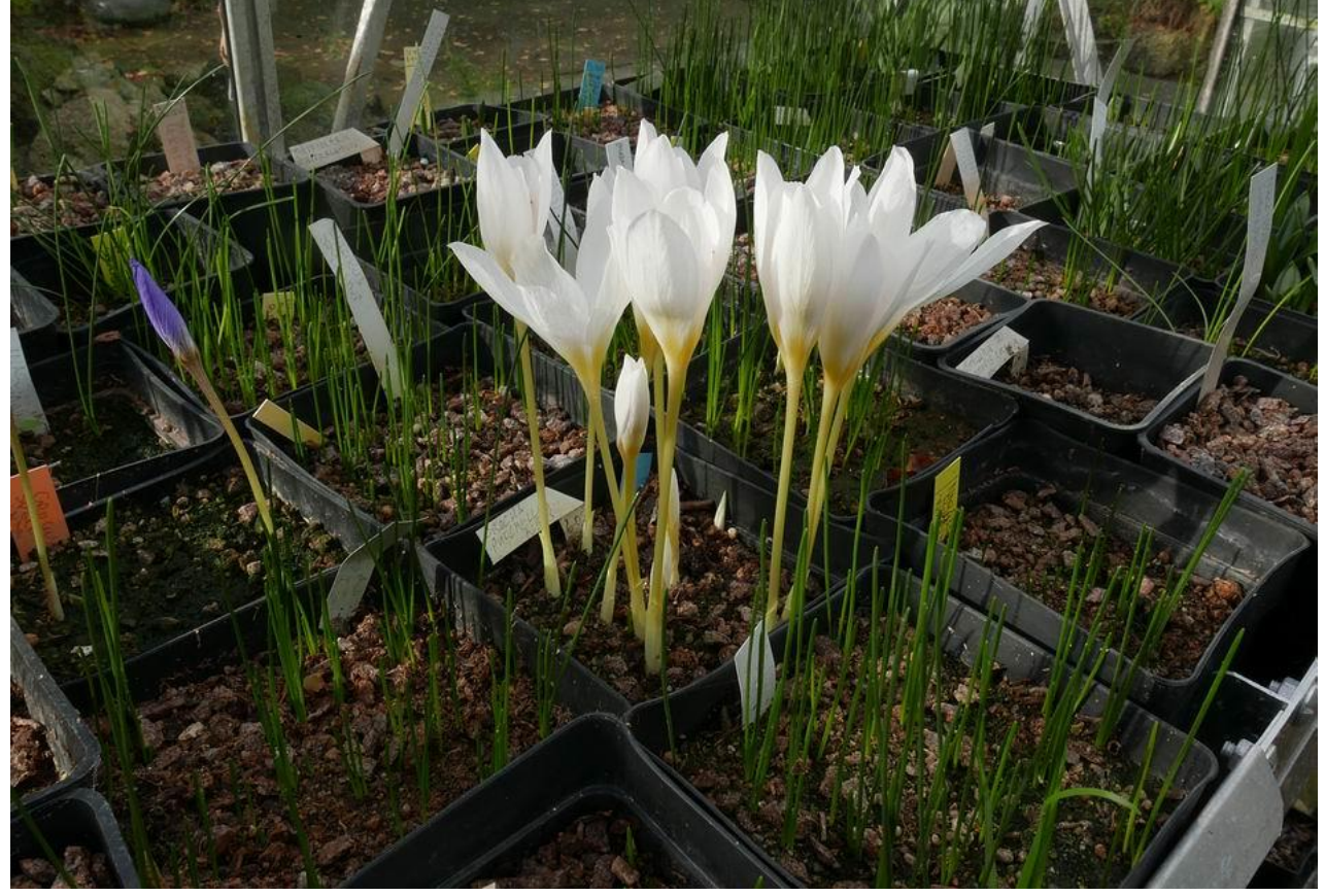
Similar plants are offered under the name of Crocus 'Zephyr' and all are great additions to the autumn garden.