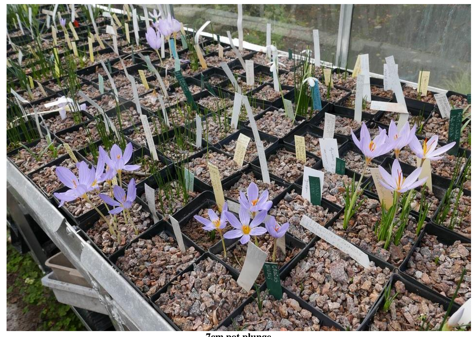
7cm pot plunge