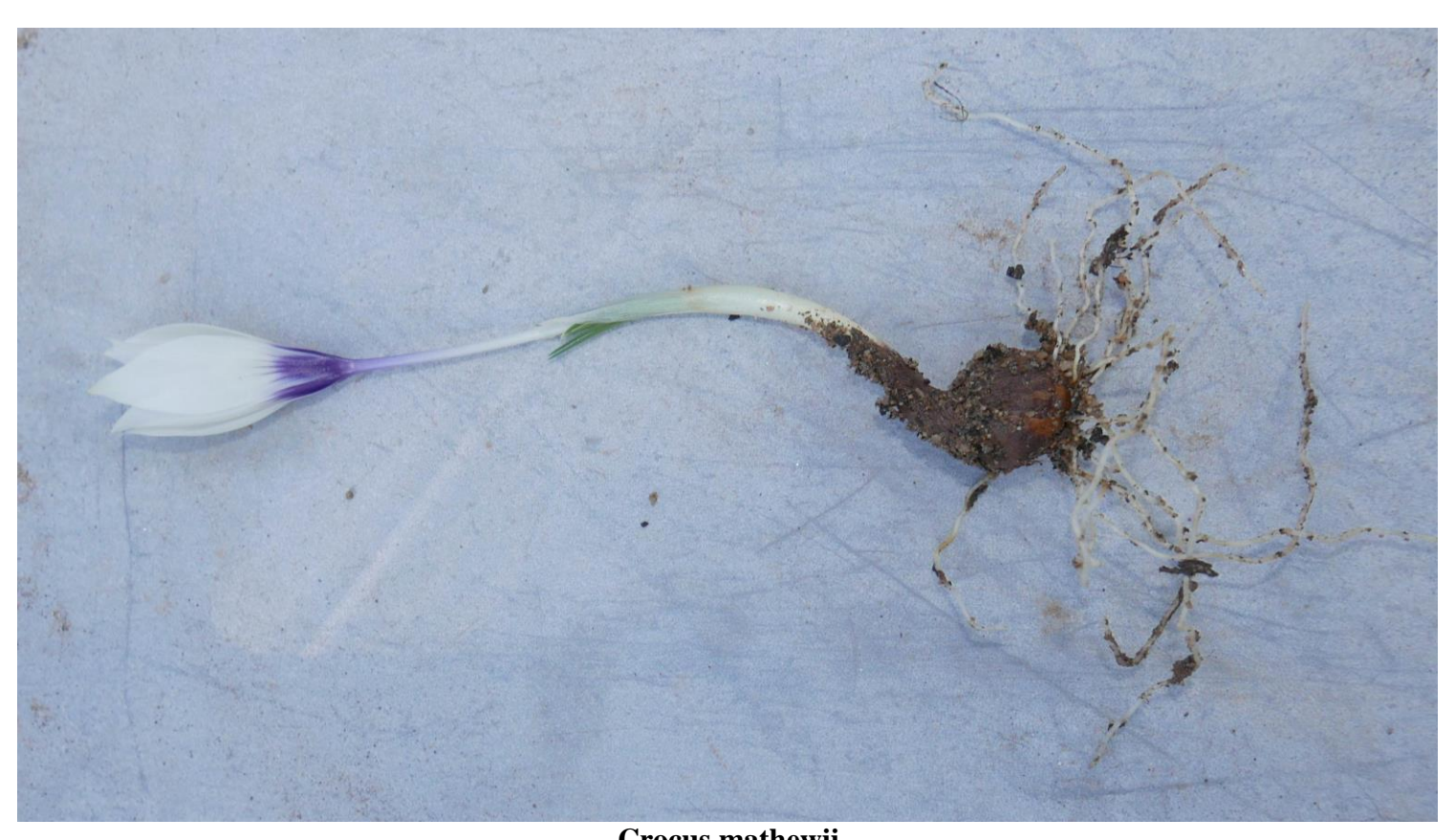
Crocus mathewii I always take photographs of the plants and bulbs for my records especially when I handle bulbs in growth.