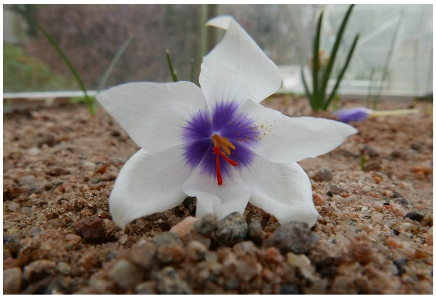
I had a 7cm pot of seedling Crocus for which I had lost the label and now it has flowered I can confirm that it is Crocus mathewii . I decided to carefully knock them out of the pot so I could replant them into one of my new bulb house plunges which I converted to sand beds.